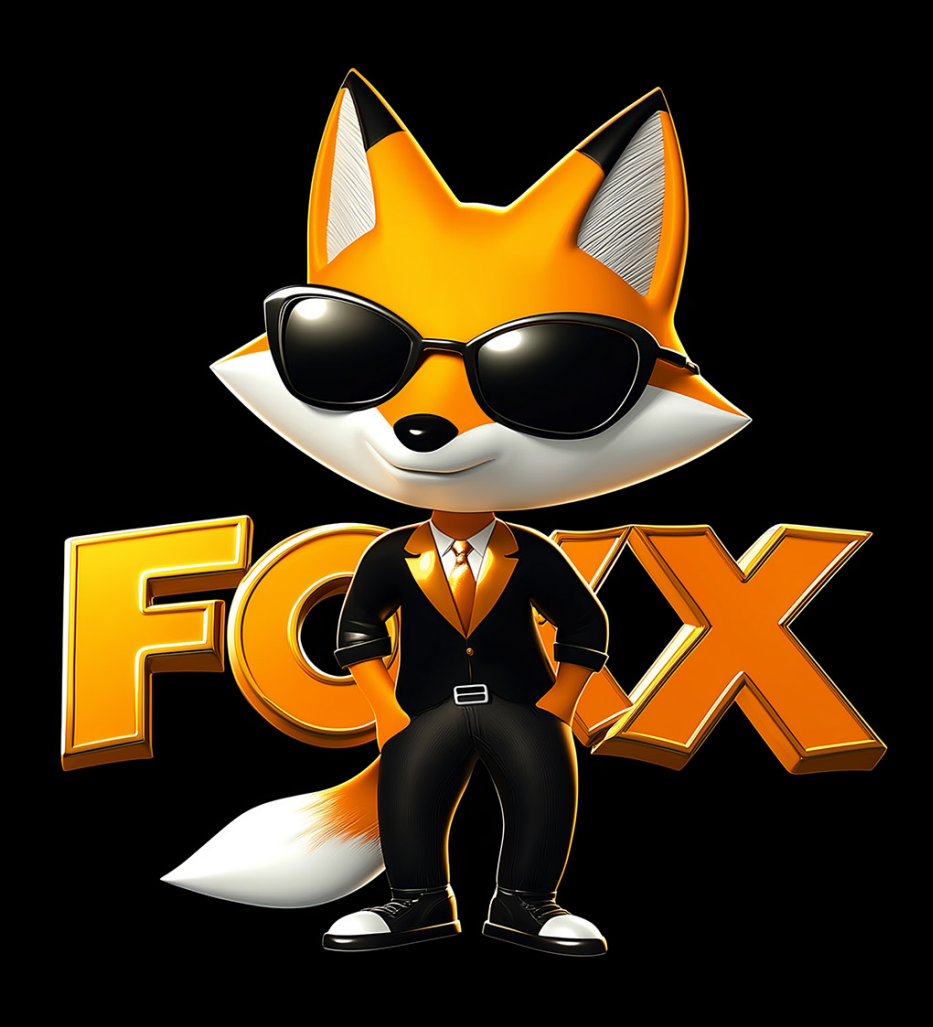
Investment Insight Fall 2024